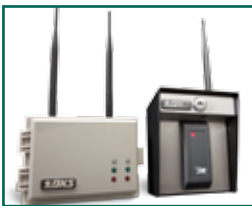
wireless expansion up to 24 entry points