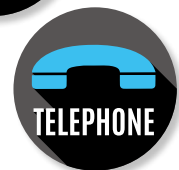
voice and remote programming use DKS service options for connection and programming