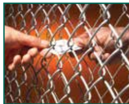
anti-pass back for complete control INTO and OUT OF secured areas