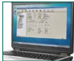
pc programmable easy to use software included