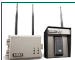
wireless expansion up to 24 entry points