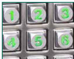
internal LED lit keypad and A-Z-CALL buttons