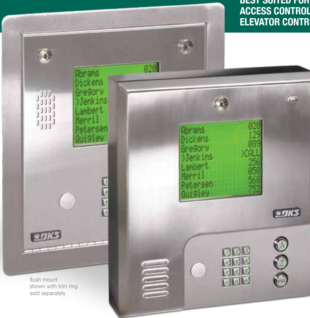
flush mount shown with trim ring sold separately

BEST SUITED FOR APPLICATIONS REQUIRING COMPLETE ACCESS CONTROL FOR UP TO 16 ENTRY POINTS, INCLUDING ELEVATOR CONTROL