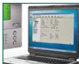
pc programmable easy to use software included