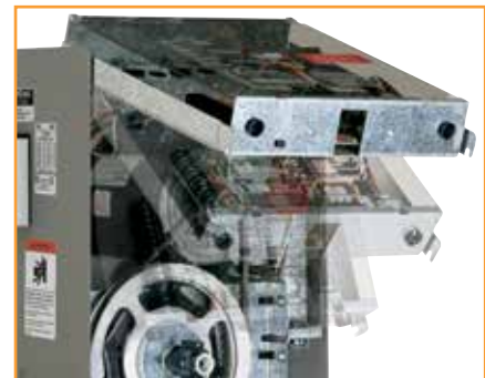
unique design allows easy access to all mechanical parts