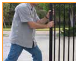
fail-safe release never be locked out (or in)