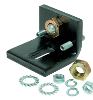
Positive stop Kit for Open Position