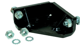
Positive stop Kit for Close Position