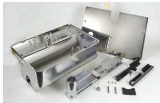
Stainless steel support box package