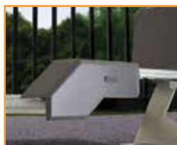
arm joint cover helps eliminate pinch points