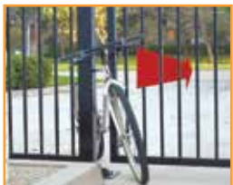
entrapment prevention system reverses gate on contact