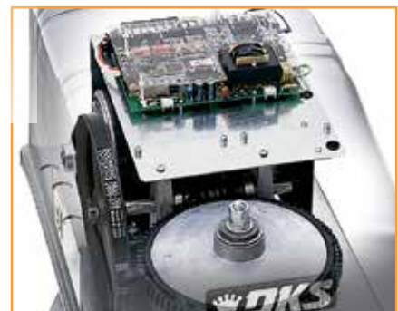
unique design simplifies installation and provides easy access to all internal parts