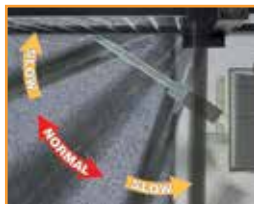
smooth operation no slamming when gate closes